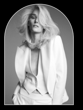
REINTERPRETATION OF ICONIC LOOKS